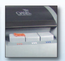
e Aqua es Standai contro