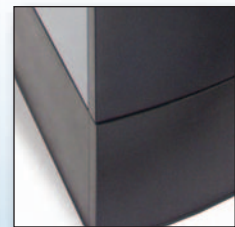
Accessory pedestal to increase faucet-to-floor height by 6-1/2".

SIDE HANDLES AND REAR ROLLERS ENABLE EASY TRANSPORT