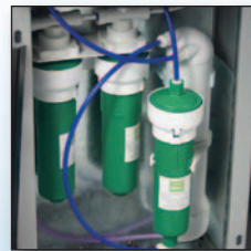
Reverse Osmosis (RO) plus GREEN FILTER filtration. (Certain Deluxe/Ultra only)