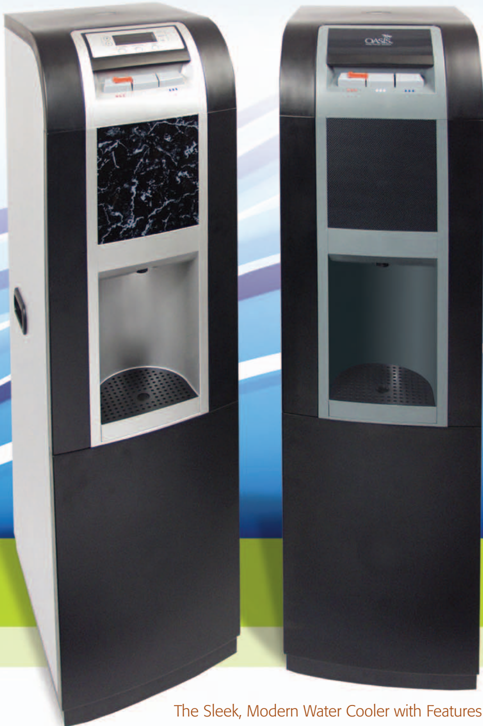
AQUA BAR II DELUXE/ULTRA WITH MARBLE STYLE PANEL