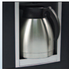
Large faucet alcove for filling sports bottles and carafes.