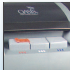
Aqua Bar II Standard Series control panel.