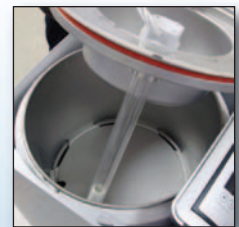
Oasis high intensity in-tank Ultraviolet (UV) system. (On Ultra only)