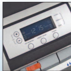
Easy to use electronic control panel located on front display panel. (On Deluxe/Ultra only)