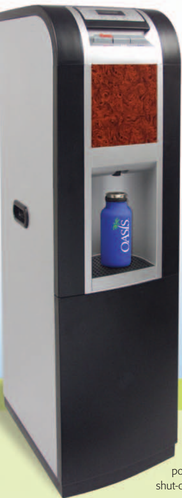
ACCESSORY BURLED WALNUT LOOK PANEL