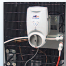
In-cabinet leak detection with inlet water shut-off. (On Ultra only)