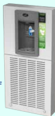
MWSM8EBF MWSM12EBF MWSMEBF