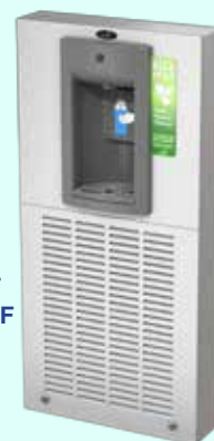
MWSMG8SBF MWSMG12SBF MWSMGSBF