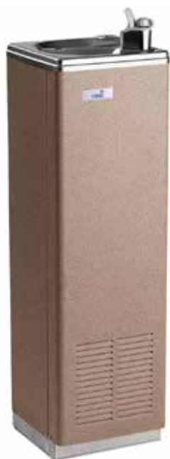
P3CP P5CP P10CP